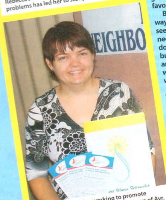
... and she's now also working to promote awareness of the issues in her home town of Ayr.

Is your life like a TV drama? Have you been able to identify with a recent storyline on a popular show? If so, write to us and tell us about it. If we use your story in TV WEEK, you'll win $500!